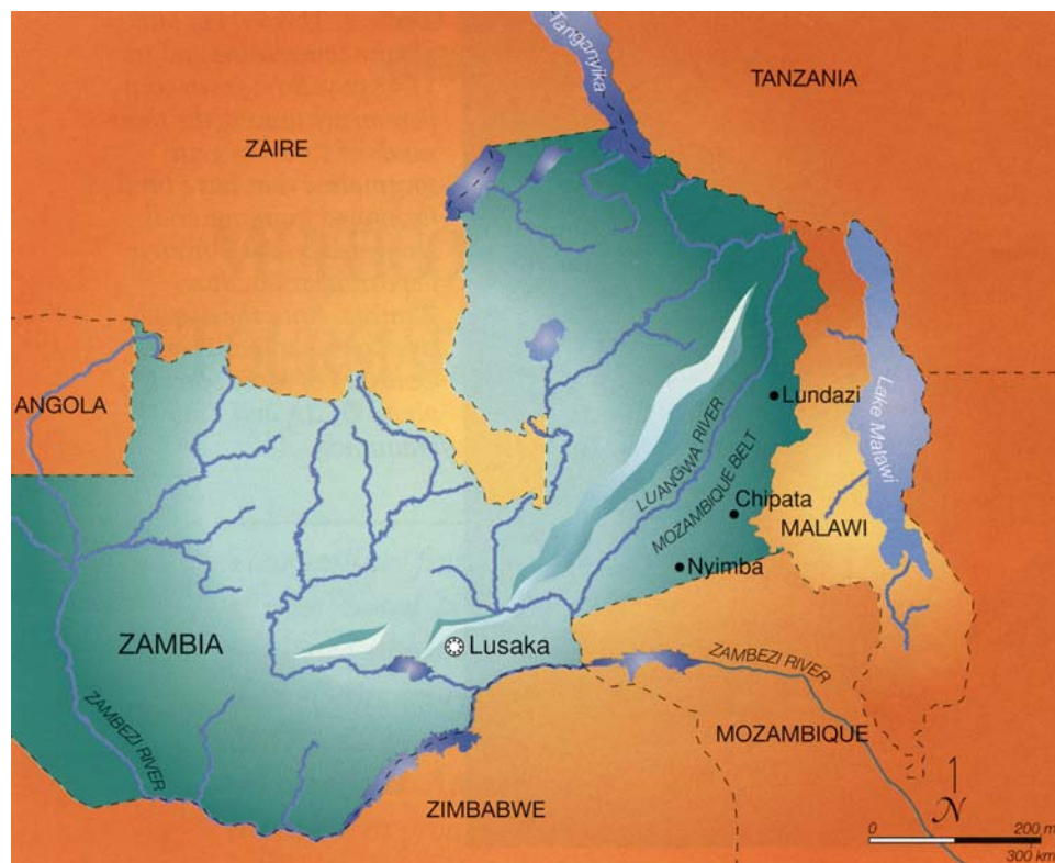
Figure 2. A new deposit of multicolored tourmalines has been found in a field in the Kalungabeba area of Zambia's Lundazi district, about 16 km southwest of the city of Lundazi.

single pit measuring about 12 m (40 feet) in diameter and 6 m (20 feet) deep. Approximately 700 unlicensed miners worked the deposit during the initial "rush"; after five died, the Ministry of Mines closed the area and then issued a number of licenses (around May 1997). At present, approximately 60 miners are working the deposit by hand, hauling loads of gravel to an adjacent water-filled depression, where wet-sieving is done to recover the gem rough. About 100 kg of facet-quality rough (and several tons of lower-quality material) had been recovered as of June 1997. By this time, Mr. Sarosi, who believes he purchased most of the available multicolored rough, had fashioned some 10,000 carats of goods, ranging up to 20 ct.