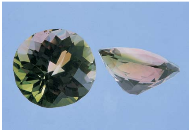
Figure 5. The multicolored nature of the fashioned stones comes from the cutter's incorporation of the different color zones in the original tourmaline rough. Attractively mixed in the face-up view of this 5.87 ct Lundazi tourmaline, the color zones are clearly evident in the side view of a 4.94 ct Lundazi stone.

EDXRF. We performed EDXRF analyses on six of the faceted tourmalines: two pink, one yellow-green, two multicolored (analyzed without regard to color orientation), and one pink-and-yellowish green bicolor in which both color regions could be separately examined. Selected-energy-region EDXRF analyses for bismuth were performed on eight additional stones—three pink, two yellow-green, and three multicolored. These analyses could be roughly quantified on the basis of the microprobe results (see below). We found major amounts