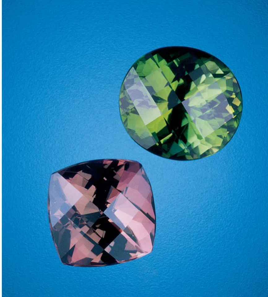
Figure 1. This 9.44 ct pink elbaite tourmaline and its 11.48 ct yellow-green companion are among the thousands of carats of gem tourmaline that have been fashioned from material recovered recently from a deposit near Lundazi, Zambia. Note the distinctive “checkerboard” cut.

the 2.05–2.68 billion-year-old Basement Complex, as well as metacarbonates, schists, metavolcanics, and quartzites of the 1.35–2.05 billion-year-old Muva Supergroup (Kamona, 1994). The gneisses and schists are intruded by later granitic pegmatites, which commonly have quartz cores and outer zones of microcline feldspars. Muscovite is usually concentrated at the contact between these zones, and aquamarine may occur in either zone. The pegmatites may also contain gem tourmaline, as well as concentrations of rare elements (Nb, Ta, Li, Cs, Y, La, and U). The Mozambique Belt also hosts gold mineralization, in sheared quartz veins occurring in schists and metavolcanics of the Muva supergroup; bismuth minerals (bismuthinite, bismutite) are found in this gold ore.