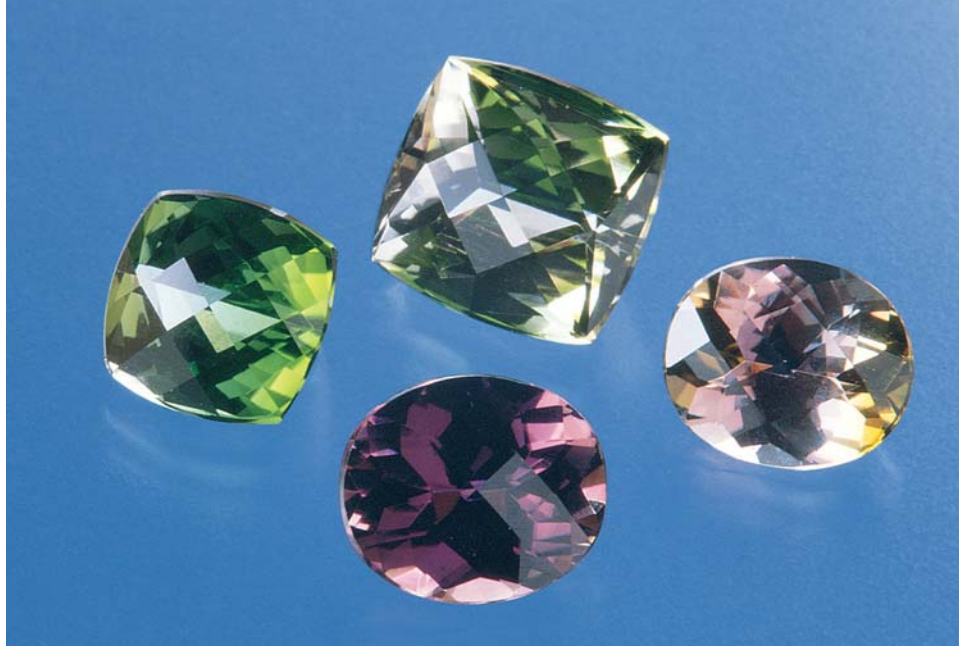
Figure 4. The multicolored tourmalines are fashioned as either a single color or as a mixture of colors in a single stone. These four elbaite tourmalines, which range from 3.38–8.14 ct, were part of the study sample.

which refractive index readings were taken had R.I.'s in the range of n_e = 1.619\text{--}1.620 and n_o = 1.637\text{--}1.639 , with birefringences of 0.018–0.020. None of the stones tested showed any reaction to UV radiation. These properties are not unusual for tourmalines of these colors.