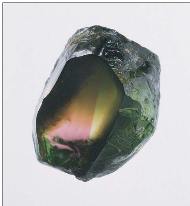
Figure 7. Microprobe analyses across the primary color zones—pink and green—in this Lundazi tourmaline nodule showed higher Bi contents in the pink core. Courtesy of Marc Sarosi; photo © GIA and Tino Hammid.